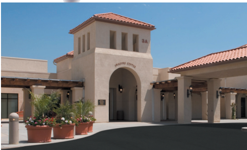
Casa Colina Diagnostic Imaging Center has been awarded a three-year term of accreditation in mammography as a result of a recent survey by the American College of Radiology

For your convenience, extended mammography hours are being offered in October! Monday-Friday from 9 am to 7 pm and Saturday from 8 am to 12 noon